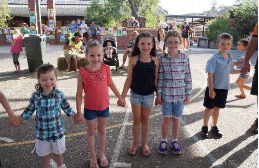
Ready to dance at the KPS school community bush dance