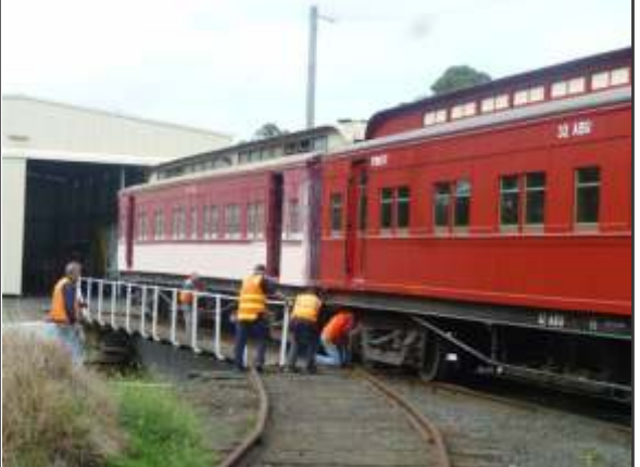
Volunteers working on the carriages in the yards at Korumburra (see article on page 12 opposite)

What's happening in Korumburra on the weekend? www.korumburracommunity.org.au