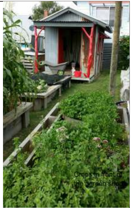
Volunteers at the flourishing Hospital gardens plus results of their hard work (see article page 29)