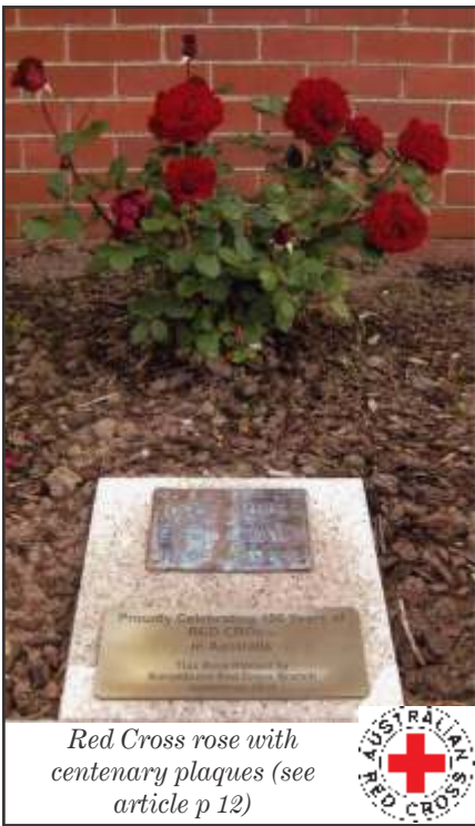
Red Cross rose with centenary plaques (see article p 12)