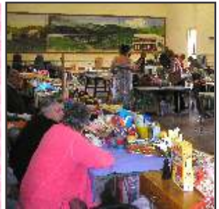
Some of the delights available at Jumbunna Bush Market (see page 23)

Designed by EJ Designs | ejdesigns@yhdco.com.au | facebook.com/ejdesignspage