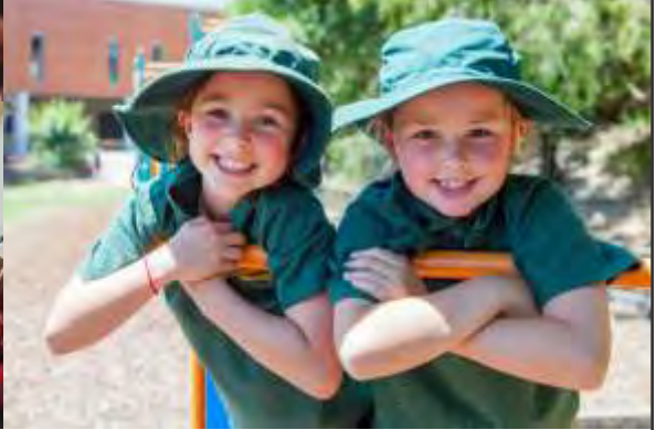
St Jo's have been very active with Crazy Hair Day and Poppy making. (see p 15 for details)