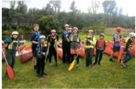
Scouts preparing for their canoeing badge

Generous donations were received from Koringal Women's Service Club, Strzelecki Lions, Masonic Lodge, Leogatha RSL and