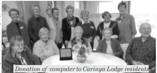
Donation of computer to Carinya Lodge residents

Fundraising has always been approached with great enthusiasm. It has included raffles, clearing sales, Trash and Treasure markets, cake stalls, "Soup and Sandwiches" at the old Post Office in the early days, car boot sales, fashion parades, casserole teas, BBQs, garden parties and lots and lots and lots of catering! There have been parties, dinners, weddings and funerals, and it is still the main way we raise money today.