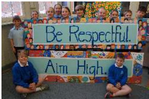
New Values signs for KPS front fence

In July KPS hosted a group of very excited pre-schoolers at our annual 'Kinder Kids Sports Clinic'. The children arrived dressed in footy colours for a fun session of footy activities – a great opportunity for them to get to know our staff and be comfortable in the school environment before starting Prep in 2016. The Clinic was a great success thanks to the efforts of