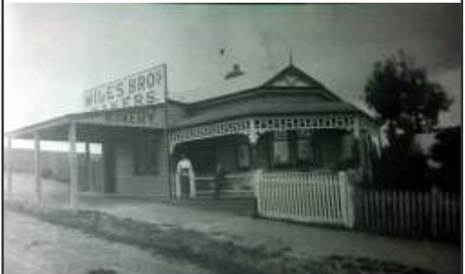
Miles' Bakery above and a Poppet head below, formerly in Mine Road