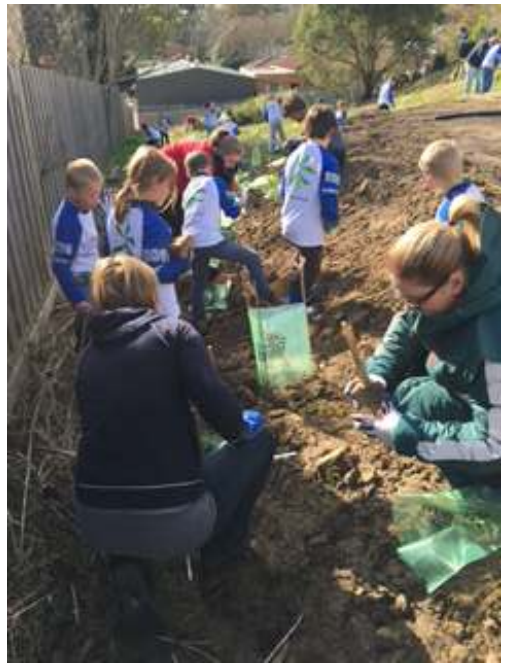
Students, staff and parents all contributed to the newly planted area at St. Joseph's Primary School. (see article p. 15 opposite)