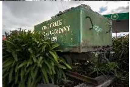
An original coal skip now located at the top of the main street near the BP service station