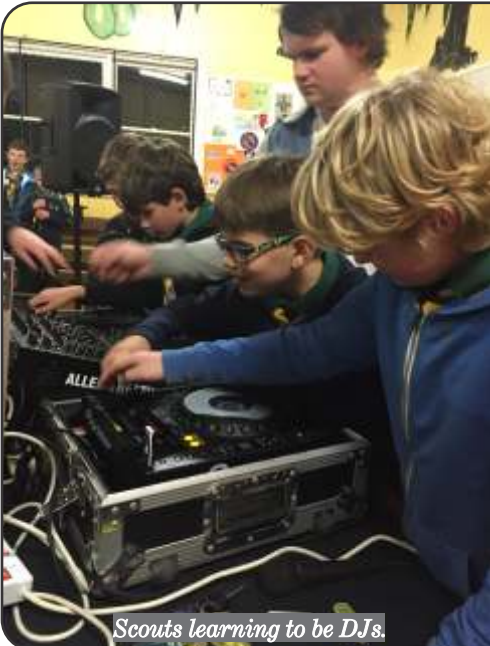
Scouts learning to be DJs.