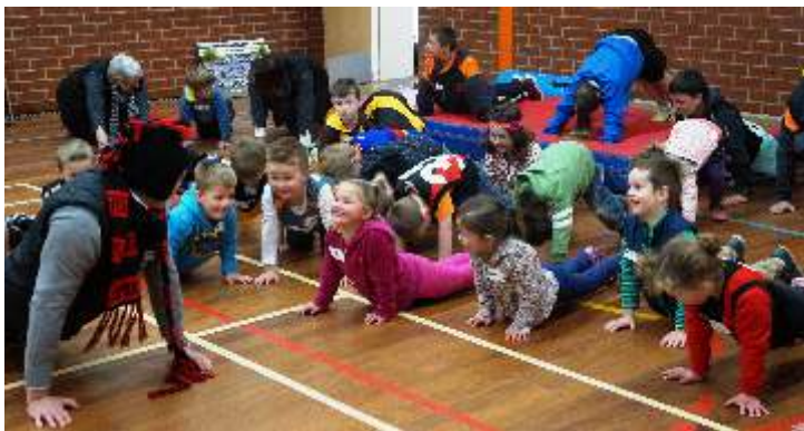
Kinder Kids Sports Clinic at KPS

Enrolments for 2016 are due by 9th September so that we can carefully plan our staffing and classes for the new year. Contact the office for further information, or to arrange a school tour: phone 5655 1309, email korumburra.ps@edumail.vic.gov.au