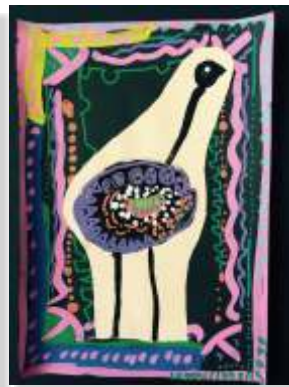
Artwork inspired by Bronwyn Bancroft