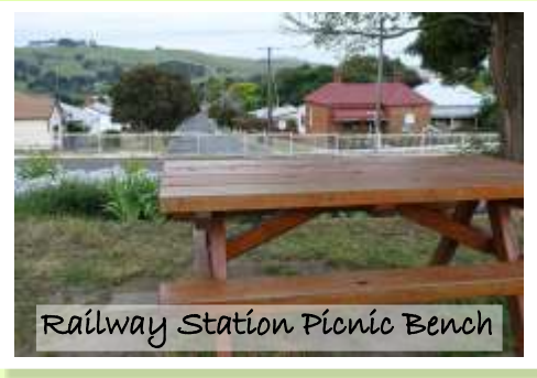
East end of station, good view north-east, toilets