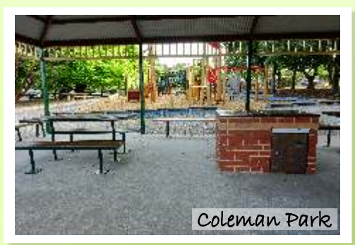
Queen St, shelter, BBQ, toilets, playground