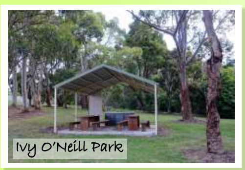
Mine Rd near Issell St, shelter, BBQ