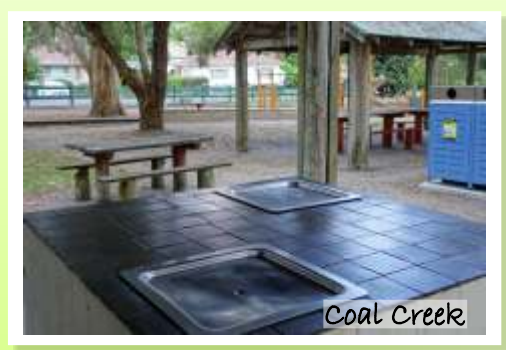
Shelter, BBQ, playground, toilets