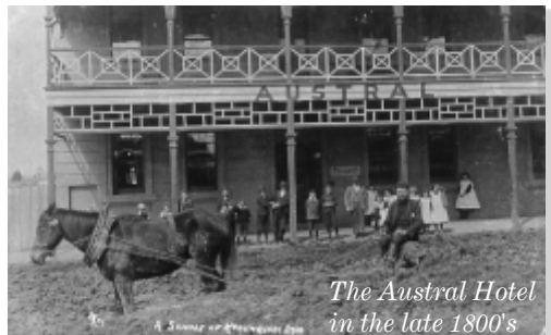
The Austral Hotel in the late 1800's