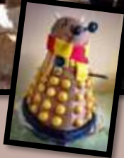
Fun at the Creek